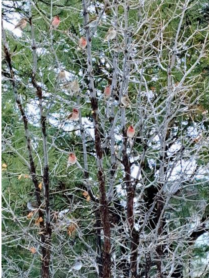
(a mixed flock of finches/juncos in Show Low area)

And remember, you can always feel free to offer your assistance to the Board. For that matter, there are some on the Board who are interested in moving on from the Board to focus on other aspects of their lives, so, we are always interested in hearing from anyone who might want to accept the fun challenges of filling a Board position! We are especially keen to recruit diverse candidates to be a part of WMAS, including more people below the age of 60 (so that we can plan for our Chapter’s future) and also more people that are representative of the various demographic groups found in the White Mountains. And remember, you can be on the Board without being an Officer – in fact, you can even just attend a Board meeting as a guest. Please feel free to join us (call Rob: 928-368-8481).